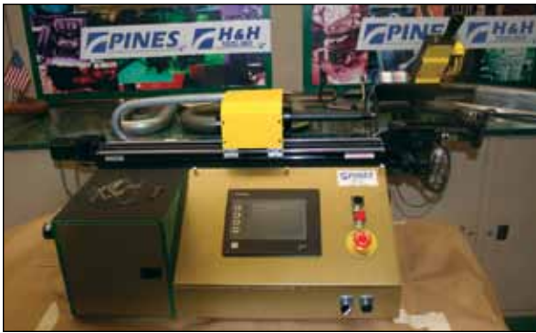
CNC-10 Coaxial Cable Bender With .141 O.D. Bend Head