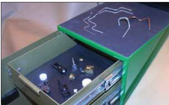
Integrated Tool Storage