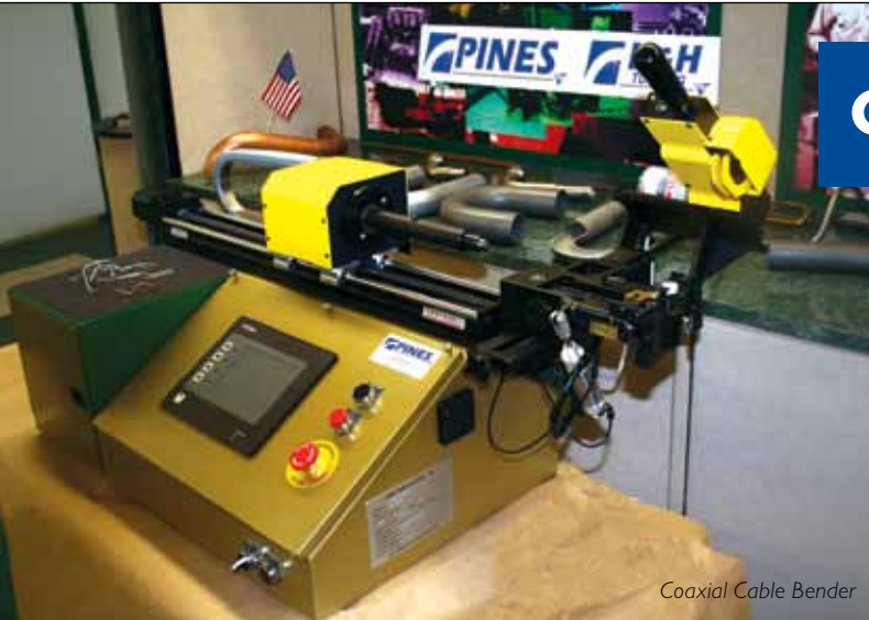
Coaxial Cable Bender